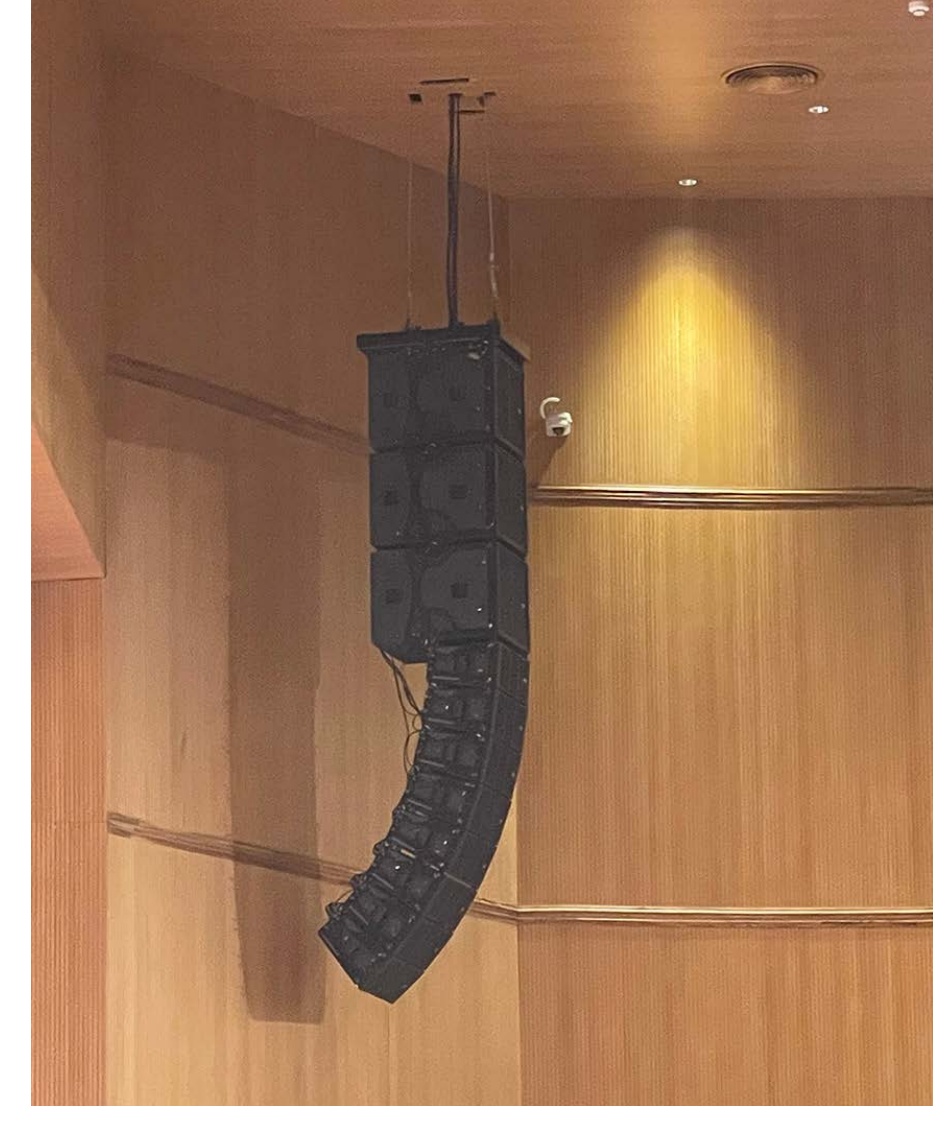
The self-powered line array system from AUDIOFOCUS completes the pro audio install at the Veronica Auditorium, promising an unrivalled audio experience for the audience

mance scenarios. Shure UA844+SWB Antenna Distribution Systems and UA874 Active Directional Antennas have also been used to ensure strong, uninterrupted wireless signals.