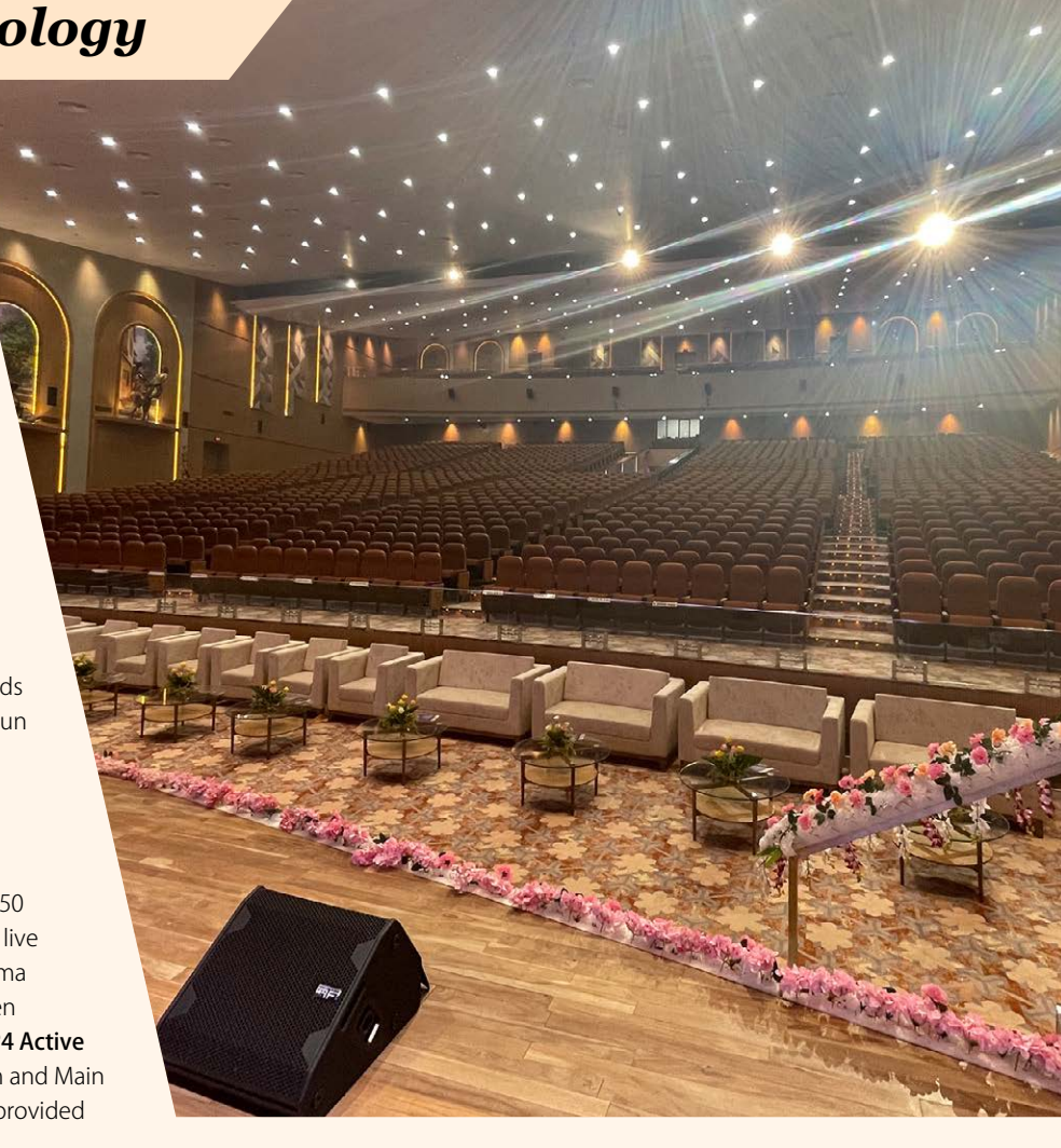
The Veronica Auditorium in Patna Women's College is equipped with a multitude of pro audio equipment, including, but not limited to, AUDIOFOCUS tops, subs, and coaxial monitors

The main PA system comprises of clusters of eight AUDIOFOCUS ARES8A line arrays on each side and a single cluster of four ARES 8a cabinets as centre fills. With the potential for